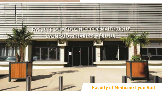
Faculty of Medicine Lyon Sud