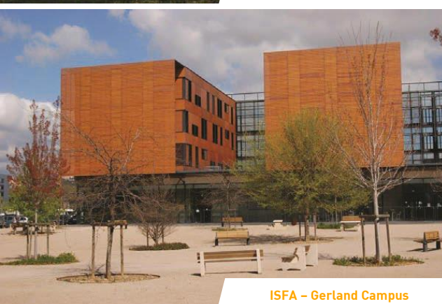
ISFA – Gerland Campus