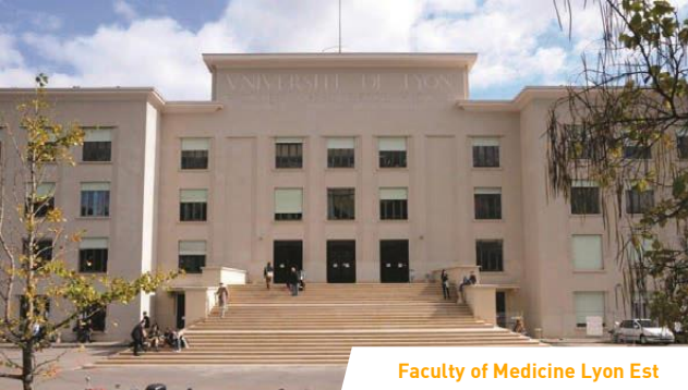
Faculty of Medicine Lyon Est