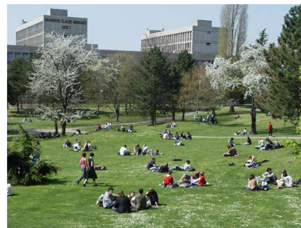
Crédits photos : © Service Communication – Eric LeRoux / UCBL, sauf (*)