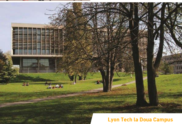
Lyon Tech la Doua Campus