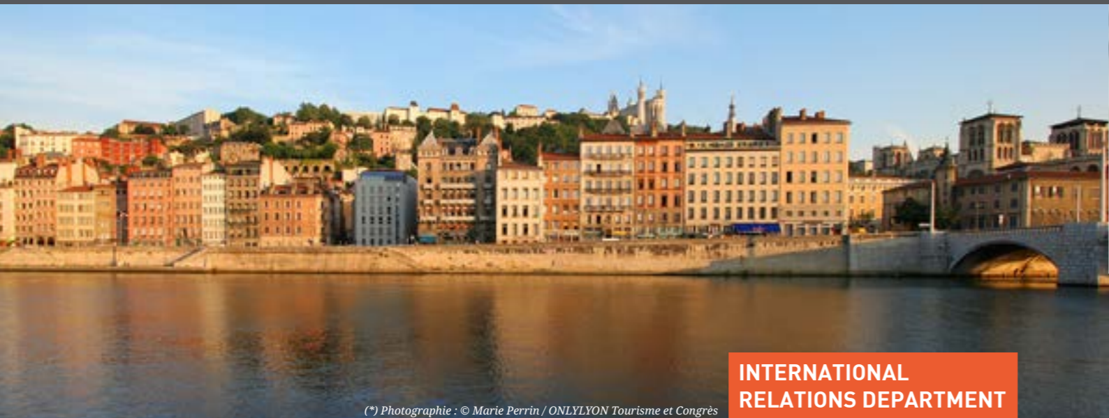
(*) Photographie : © Marie Perrin / ONLYLYON Tourisme et Congrès